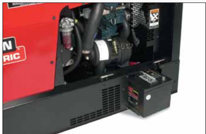
Convenient slide-out battery drawer.