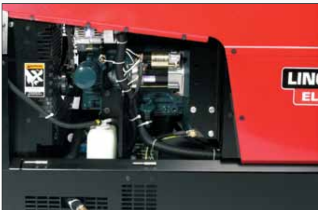
Removeable engine access door and oil drain hose.