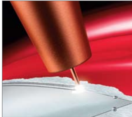
Thin sheet metal autobody work