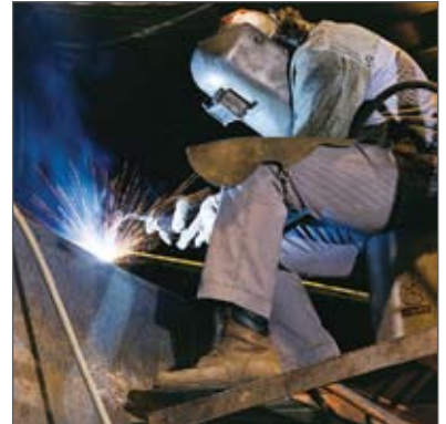
through to medium section