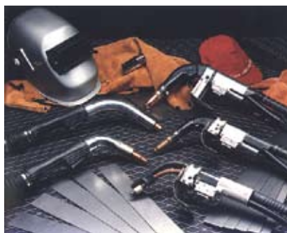
Ask about our range of Lincoln Electric® fume extraction torches and nozzles